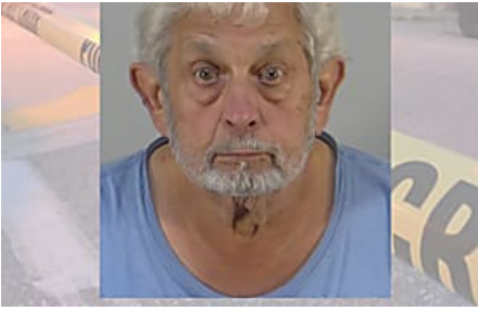
Senior's series of stroking on front porch led witness to record video, police say