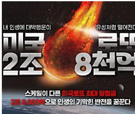
인생역전 드라마!! 다음 주인공은 당신?!