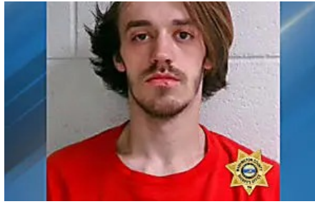
Tennessee woman escapes month-long camper kidnapping; Suspect behind bars