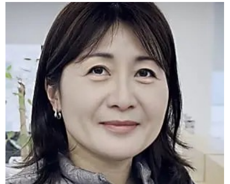
나빠지면 회복하기 어려운 청력! 보청기 무료체험은 어떠세요?